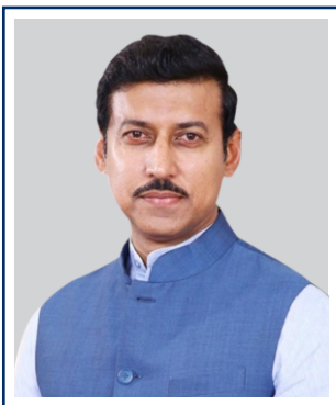
Shri Rajyavardhan Rathore Hon'ble Minister for Industry and Commerce

Rajasthan State Industrial Development and Investment Corporation Ltd. (RIICO) is the Principal Sponsor. As one of the most awaited exhibitions, India Stonemart has created a niche in the international exposition scenario. World-class infrastructure, facilities, and services will be offered to participants it will be an ideal destination for exploring business deals and networking with industry stalwarts to foster business growth.