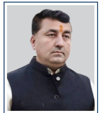
Shri K.K. Vishnoi Hon'ble Minister of State for Industry and Commerce