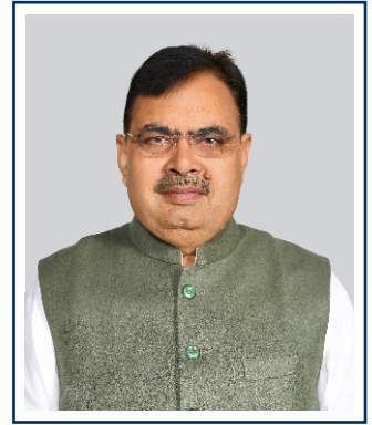
Shri Bhajanlal Sharma Hon'ble Chief Minister Rajasthan