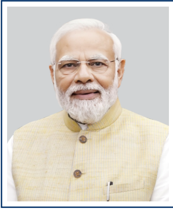
Shri Narendra Modi Hon'ble Prime Minister