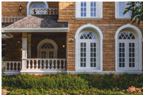
Commendation - Exterior Facings : The Golden Hue Residence