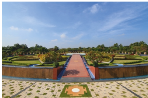
Winner - Landscaping : Shantivan Memorial