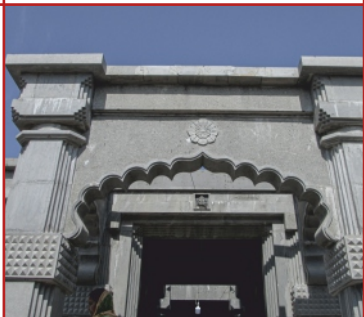
Green Architecture : Vitthalai Temple