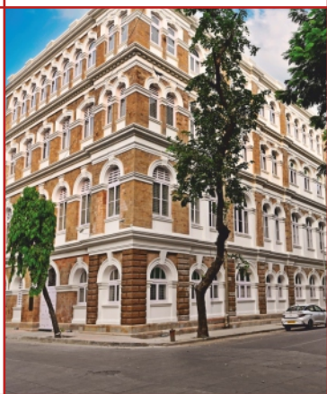
Exterior Facings : Thomas House