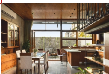
Interior designs : Carving a Court