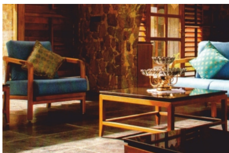
Commendation - Green Architecture : Amroliwala Residence