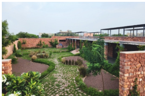
Commendation - Landscaping : Filos 24/7