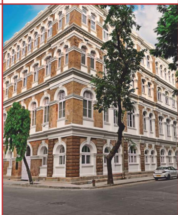
Exterior Facings : Thomas House