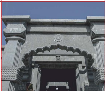
Green Architecture : Vitthalai Temple