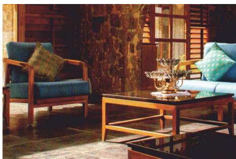
Commendation - Green Architecture : Amroliwala Residence