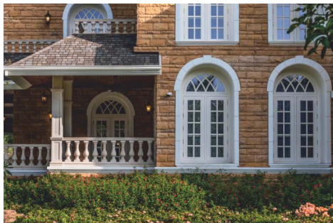
Commendation - Exterior Facings : The Golden Hue Residence