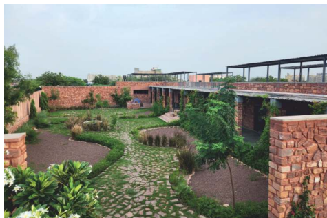
Commendation - Landscaping : Filos 24/7