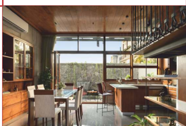
Interior designs : Carving a Court