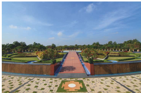
Winner - Landscaping : Shantivan Memorial